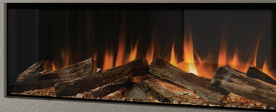
This image - Volante 1250 Cover image - Volante 1500

An Evonic fire offers more than warmth - it adds atmosphere, elegance and a sense of design-led comfort to any living space.