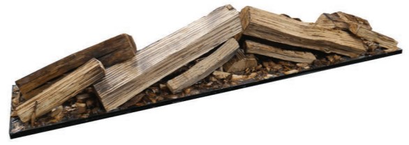
Cotswold fixed hand-crafted logs